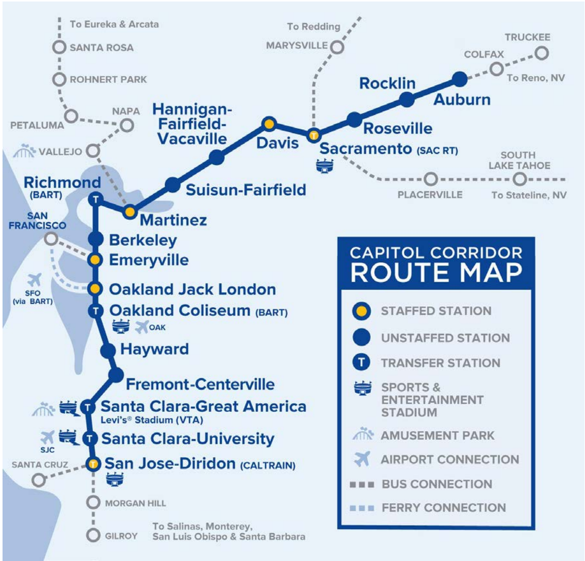
Figure 1-1 Map of Capitol Corridor Service Area

efficiency, and improve safety. Appendix A presents an overview of the financial performance and ridership growth of the Capitol Corridor service since its inception in December 1991.