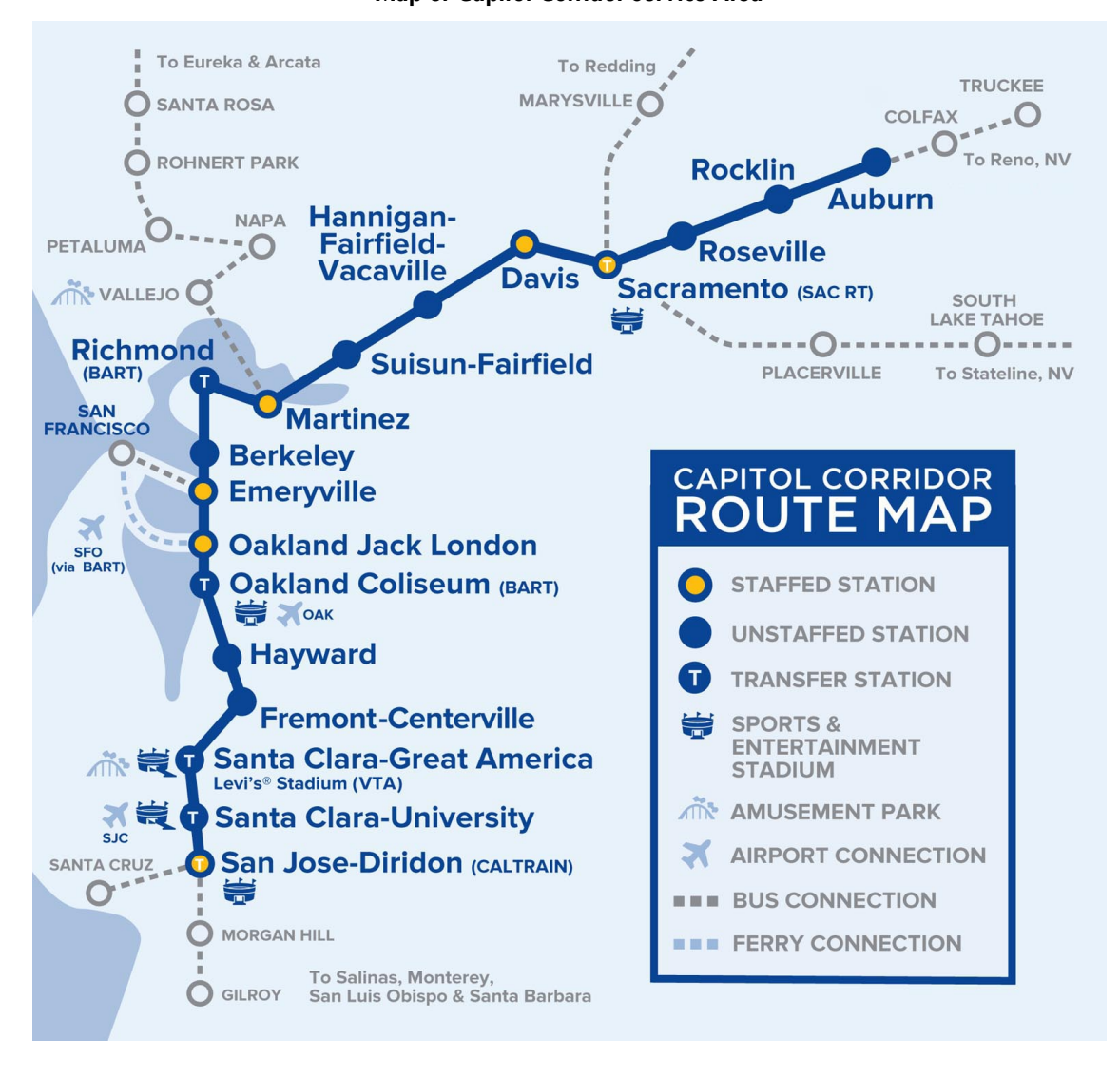
Figure 1-1 Map of Capitol Corridor Service Area