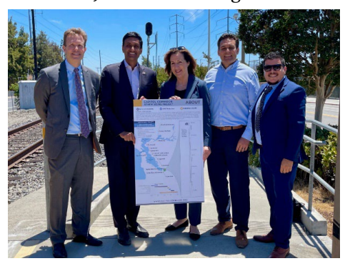
phase is complete.

Levi's Stadium; and 2) Reduce delays to Capitol Corridor and ACE trains due to unscheduled meets in the current single-track territory. These delays cascade throughout the respective train systems, causing further service disruptions and delays. While the design was advancing, CCJPA has been working with the respective utility owners to be sure their facilities that cross under the railroad are protected or relocated in the area where the new track will be constructed. This utility relocation work is a prerequisite to the construction of the project. Presently, the CCJPA is working to secure the remaining funds to implement the project as soon as the design