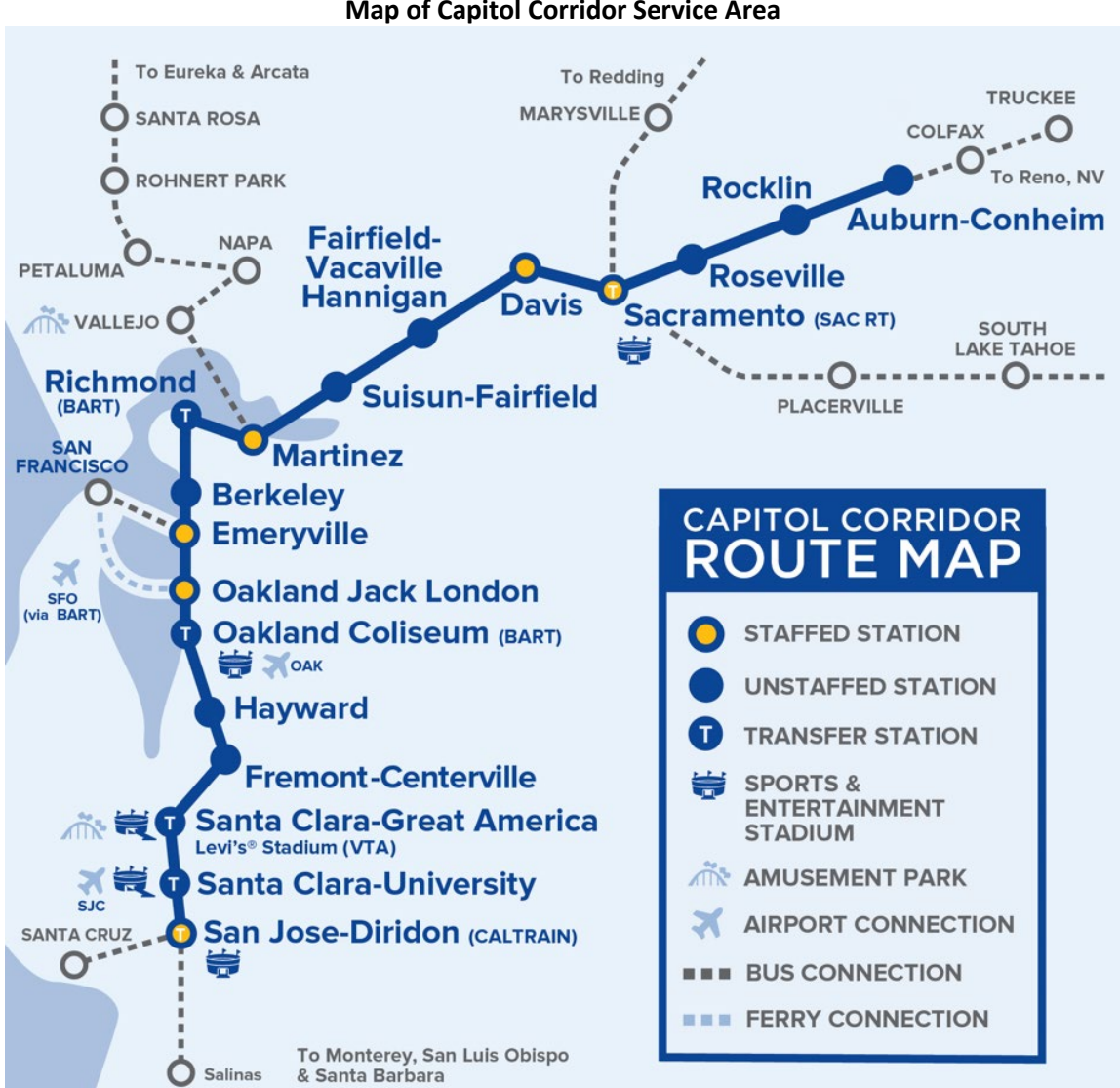
Figure 1-1 Map of Capitol Corridor Service Area